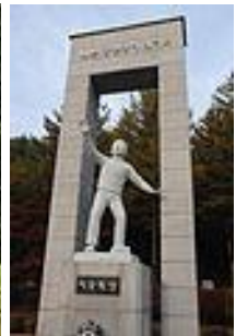
Culture and natural beauty

http://www.heritage.go.kr/heri/cul/imgHeritage.do?ccimId=1612134&ccbaKdcd=11&ccbaAsno=02210000&ccbaCtcd=32#