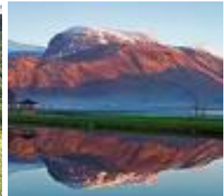
Inverness Castle Highlands