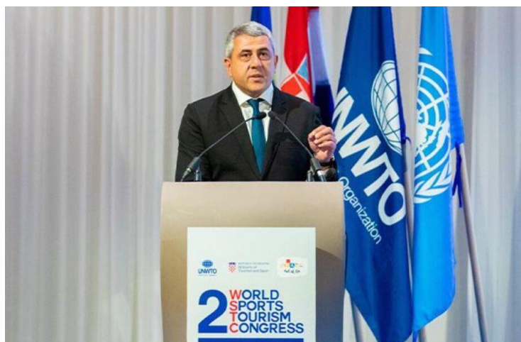
Mr Zurab Pololikashvili, Secretary-General of the UNWTO on opening the 2 nd World Sports and Tourism Congress in Zadar – Republic of Croatia